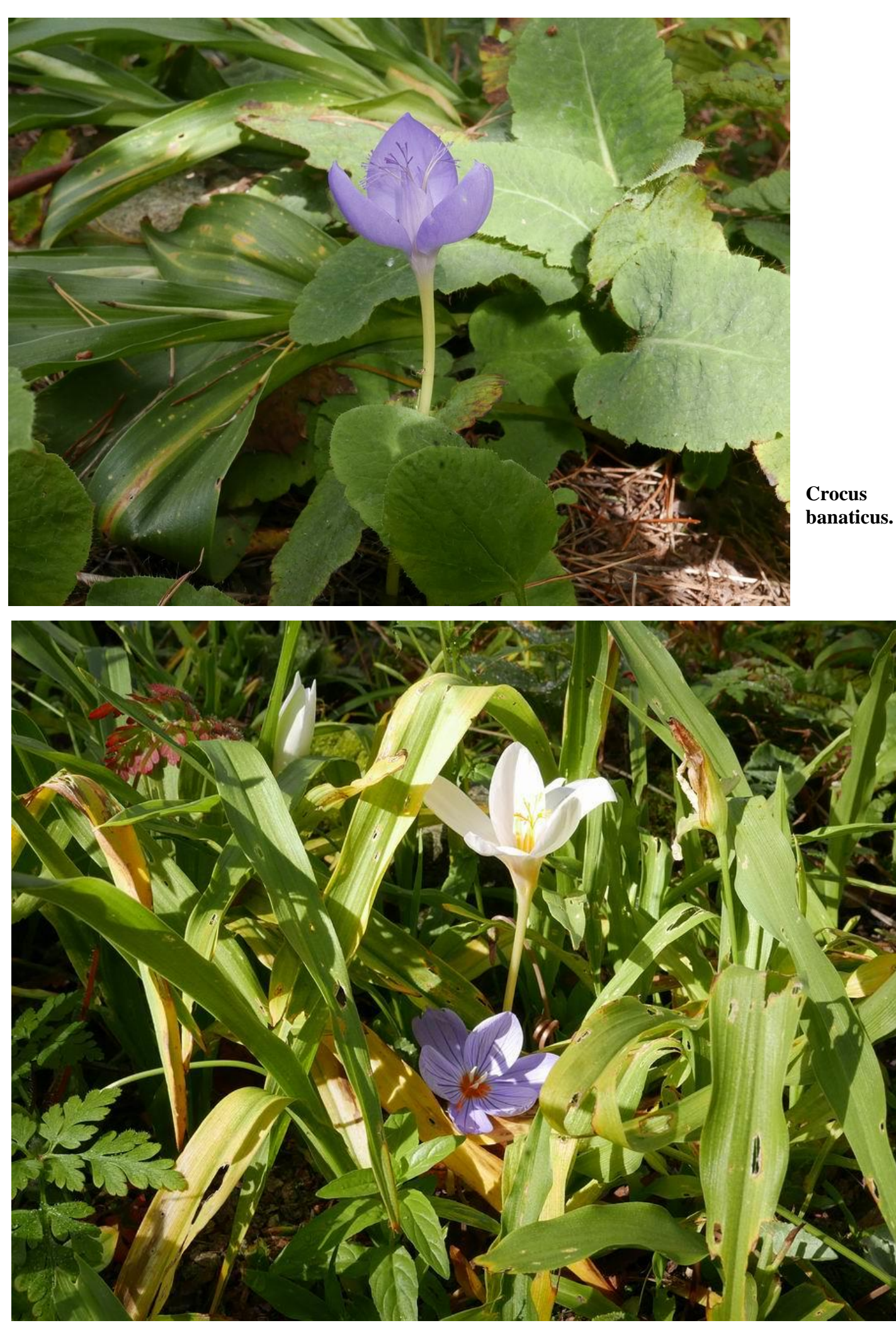
A large white Crocus speciosus hybrid and Crocus pulchellus peeking through the yellowing Roscoea foliage.