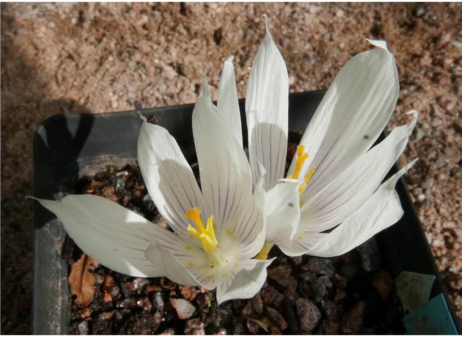
In the frame Crocus vallicola is flowering in a number of pots, some are in their own pot, others have decided to join their neighbours by self-seeding in with some of the other bulbs.

It is a busy time for me both in the garden and travelling around to give talks -I am just back from giving a talk in Belfast and will soon head across to Uppsala in Sweden for a weekend of talks on bulbs from an international list of speakers. While I am travelling the autumn bulbs are coming into flower in the garden and as many of the blooms are delicate and last only for a short time, especially in the wind and rain, I am missing seeing some of them at their best.