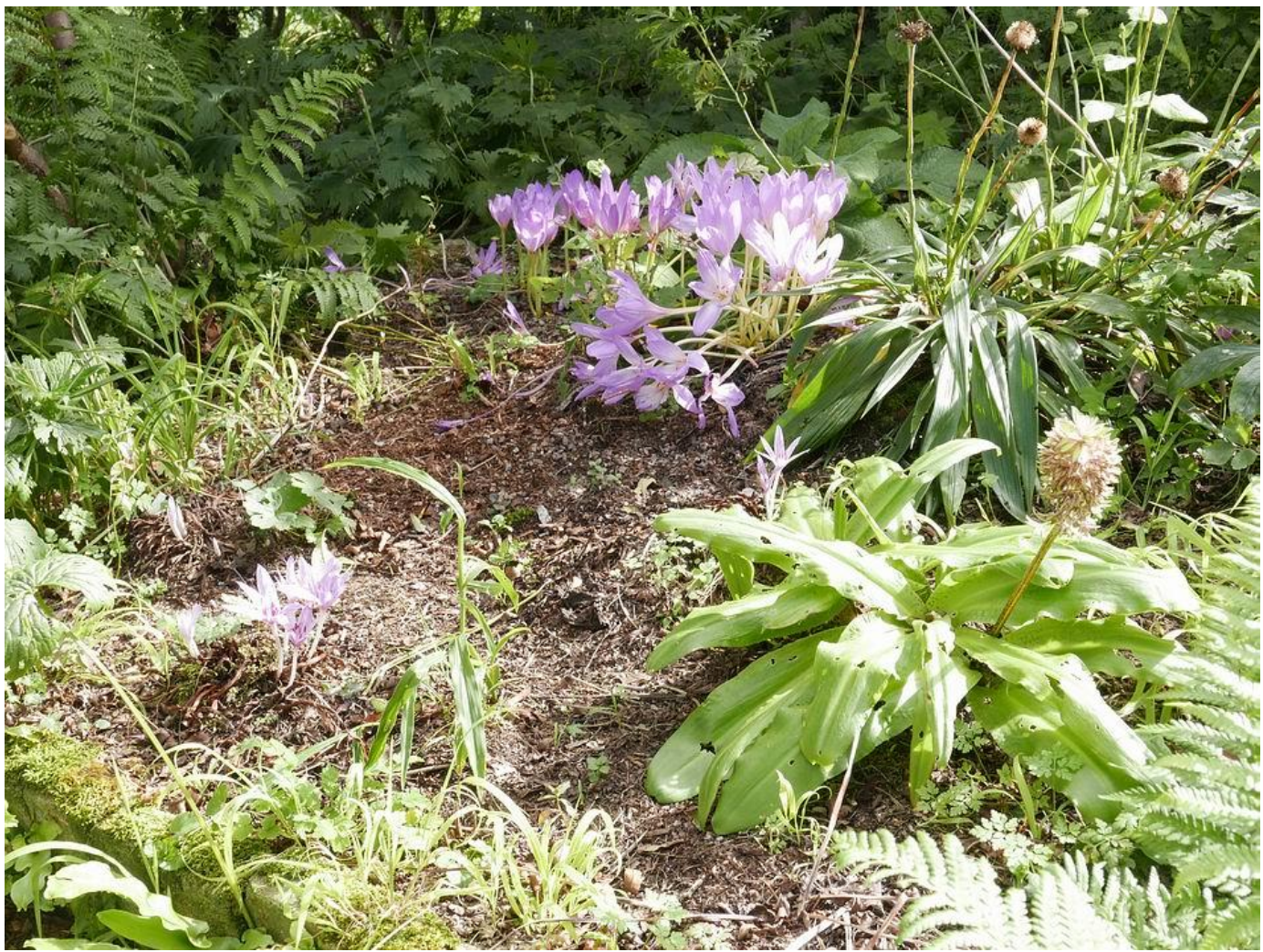
On checking I find that the autumn flowering is slightly behind last year's timing with many of the crocus still to make an appearance.