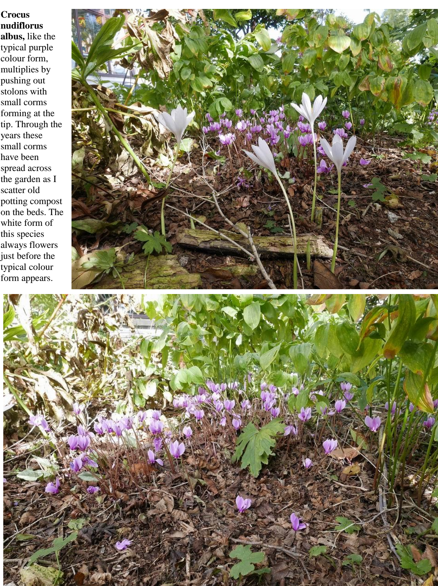
Cyclamen hederifolium flowers rise up from the large woody corm and will soon be followed by the leaves as the surrounding foliage of other herbaceous plants starts to turn yellow in preparation for a winter underground.

nudiflorus albus, like the typical purple colour form, multiplies by pushing out stolons with small corms forming at the tip. Through the years these small corms have been spread across the garden as I scatter old potting compost on the beds. The white form of this species always flowers just before the typical colour form appears.