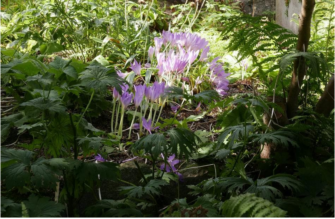
Here various Colchicum cultivars put on their colourful display, picked out in the autumn sunshine.