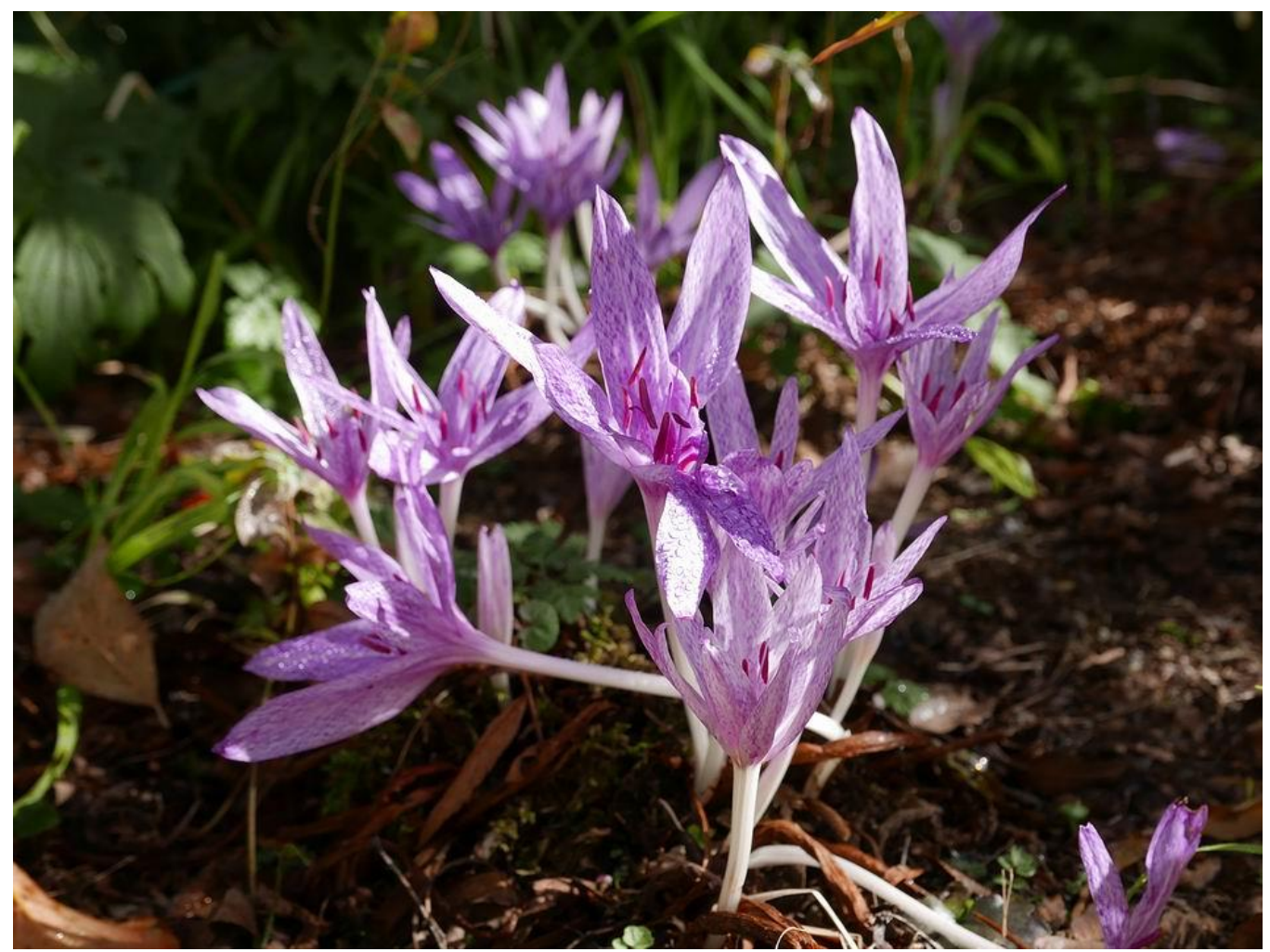
We have more than one form of Colchicum × agrippinum this is the one with the most defined tessellation.