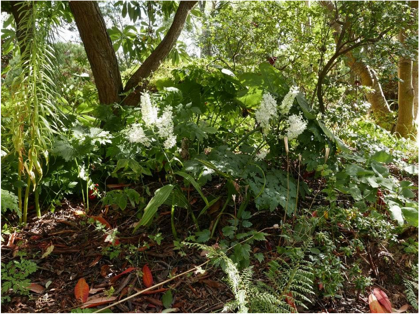
Other plants that extend the flowering season into the autumn include Veratrum fimbriatum.