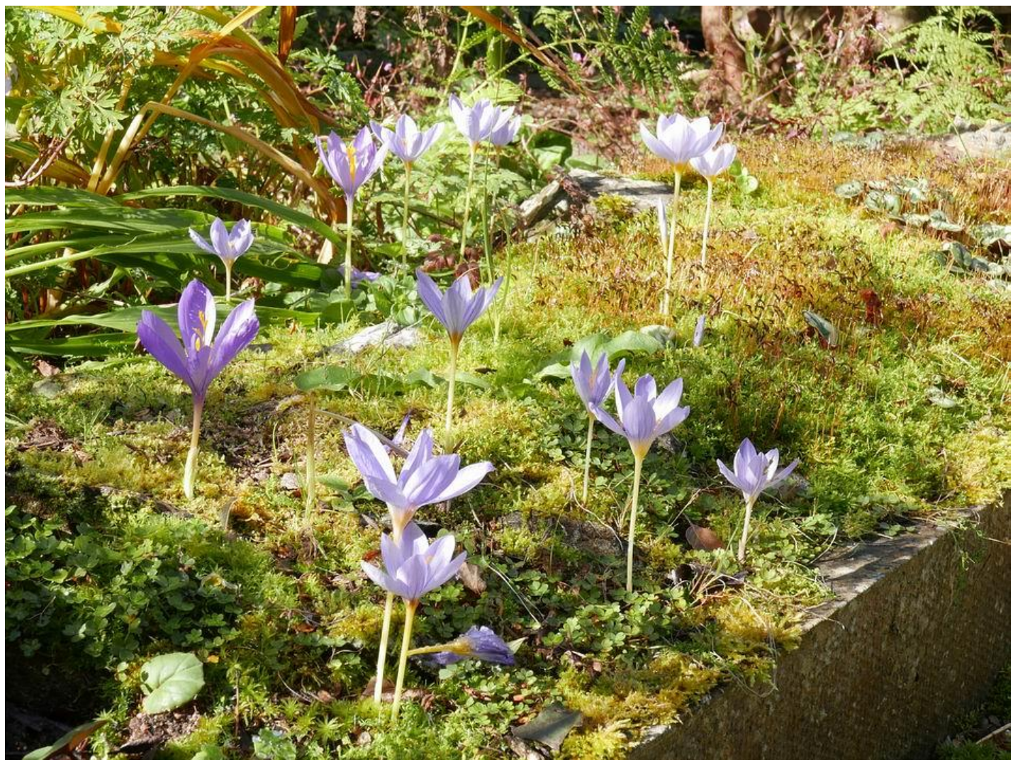
I will round off this week with some of the crocus growing happily in the moss covered sand bed.....