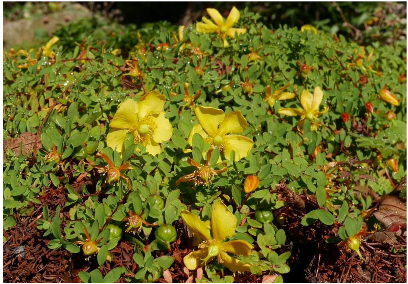
Hypericum reptans , also growing on the slab beds, is another of the plants that doesn't start to flower until July but once it starts it just keeps on flowering until the winter freeze arrives.