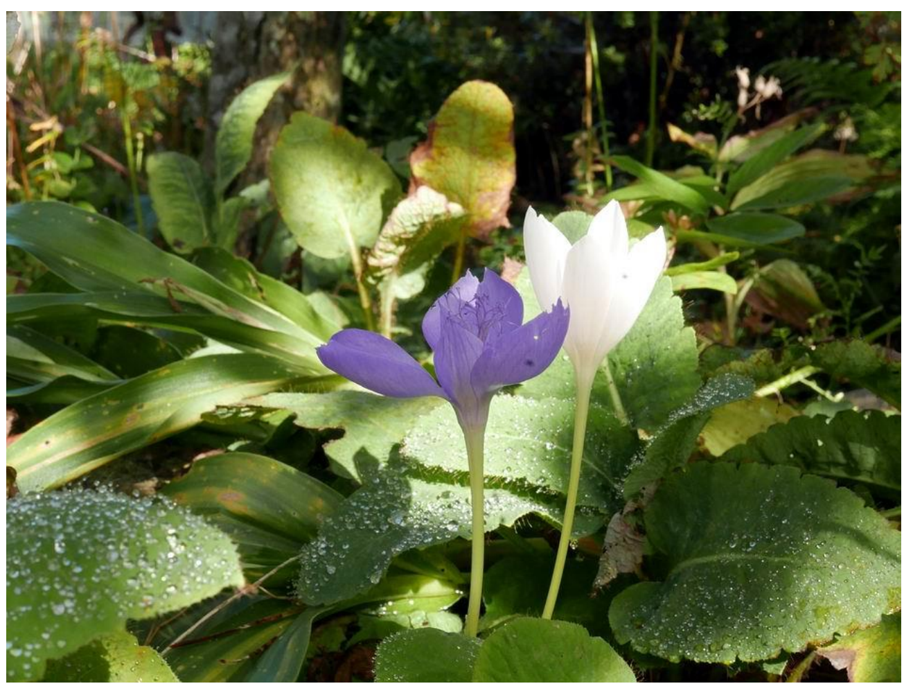
Crocus banaticus and Crocus nudiflorus albus.