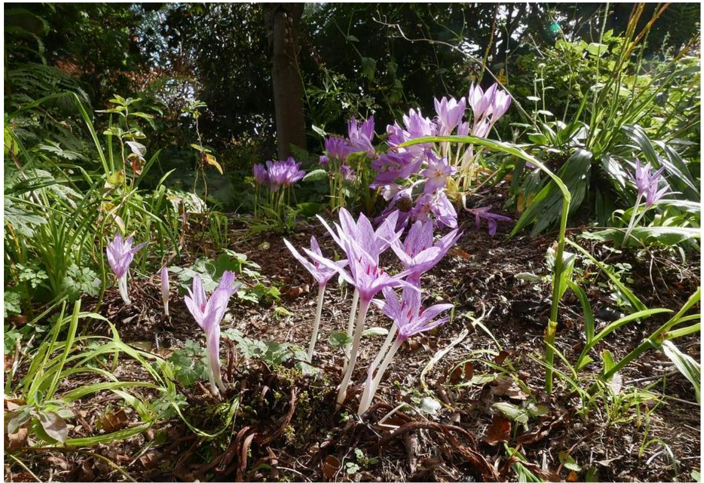
In the foreground, and below, are the flowers of Colchicum × agrippinum a plant which some think is a hybrid between C. variegatum and C. autumnale.