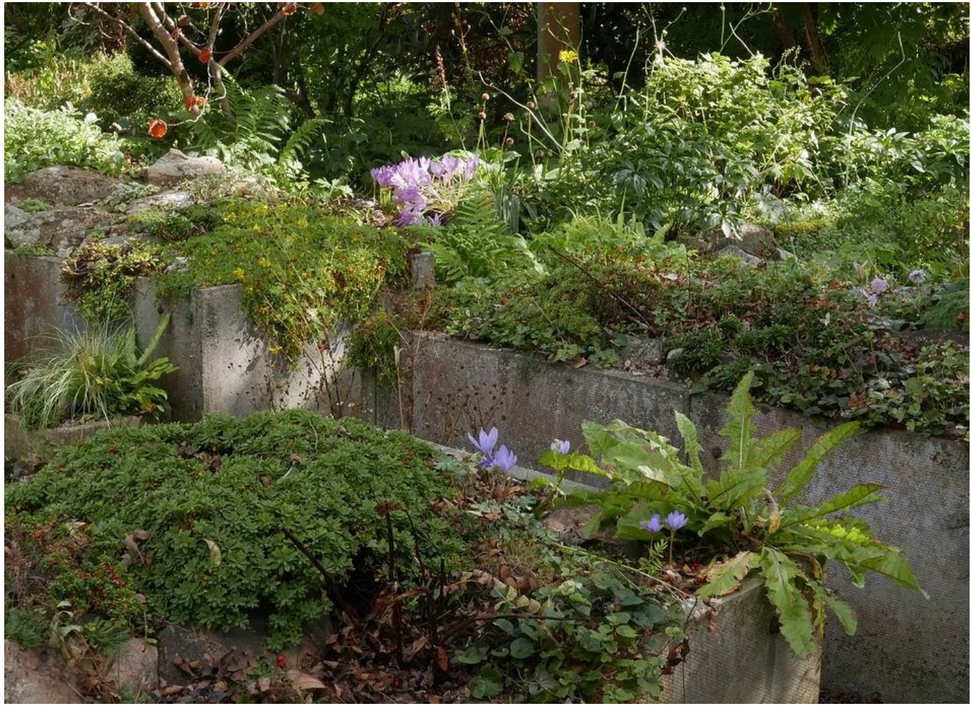
Slab beds with Crocus in the foreground and Colchicum in the background