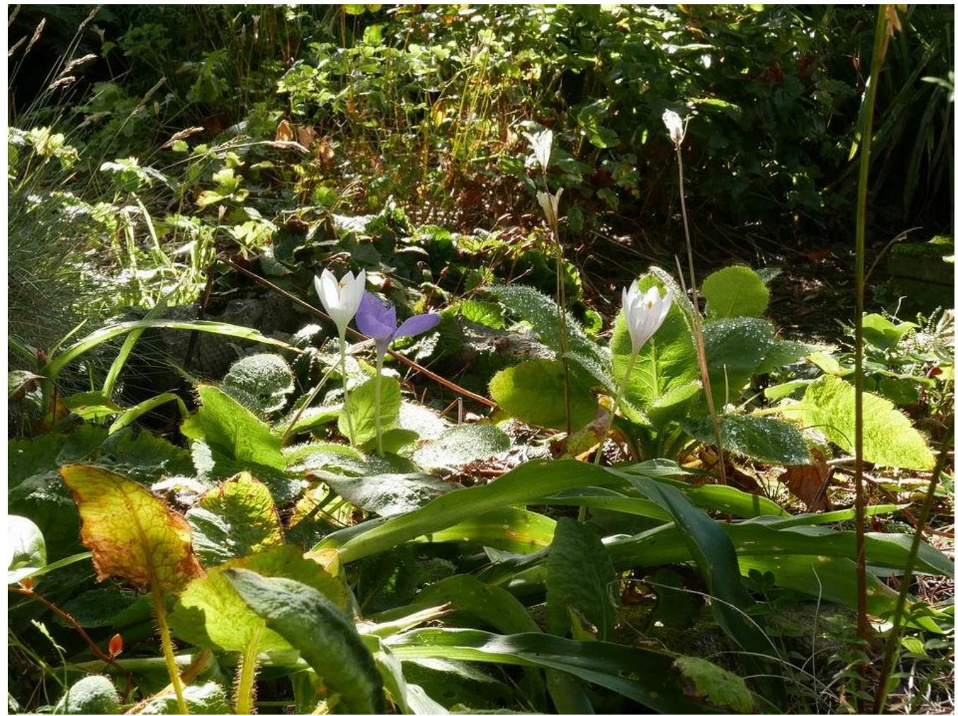
Autumn crocus among the autumn foliage photographed in the autumn light, Crocus nudiflorus albus and Crocus banaticus .