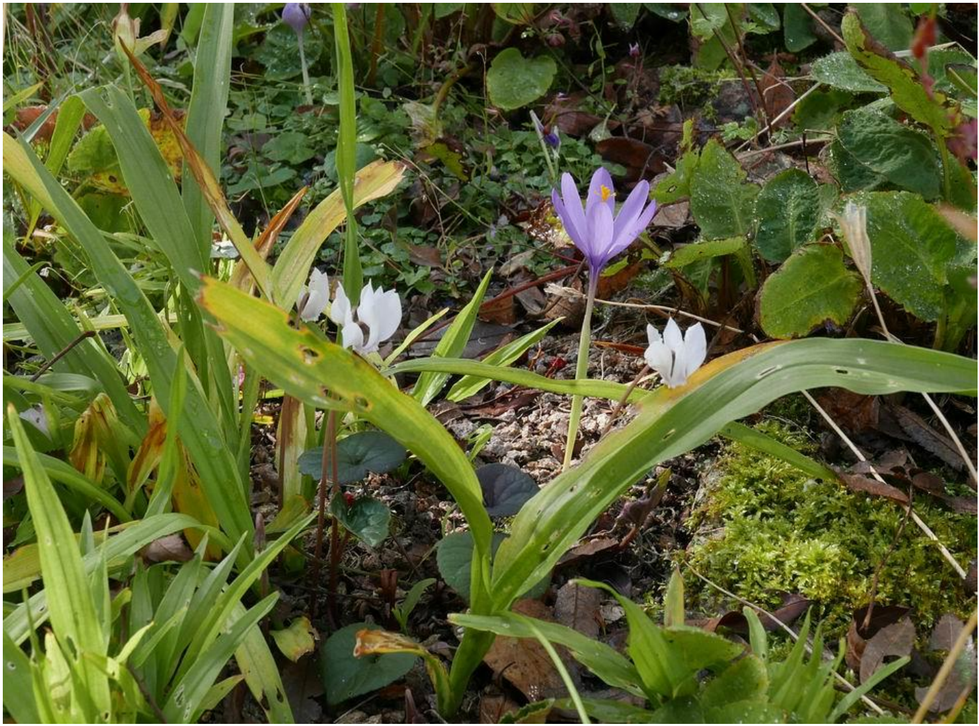
Above and below I show images of the typical colour form of Crocus nudiflorus .