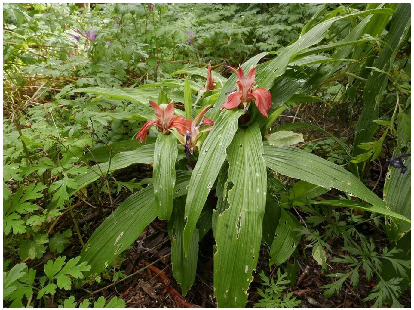
Roscoea purpurea, 'Red Gurkha' bearing the scars of munching molluscs continues to give a colourful display.