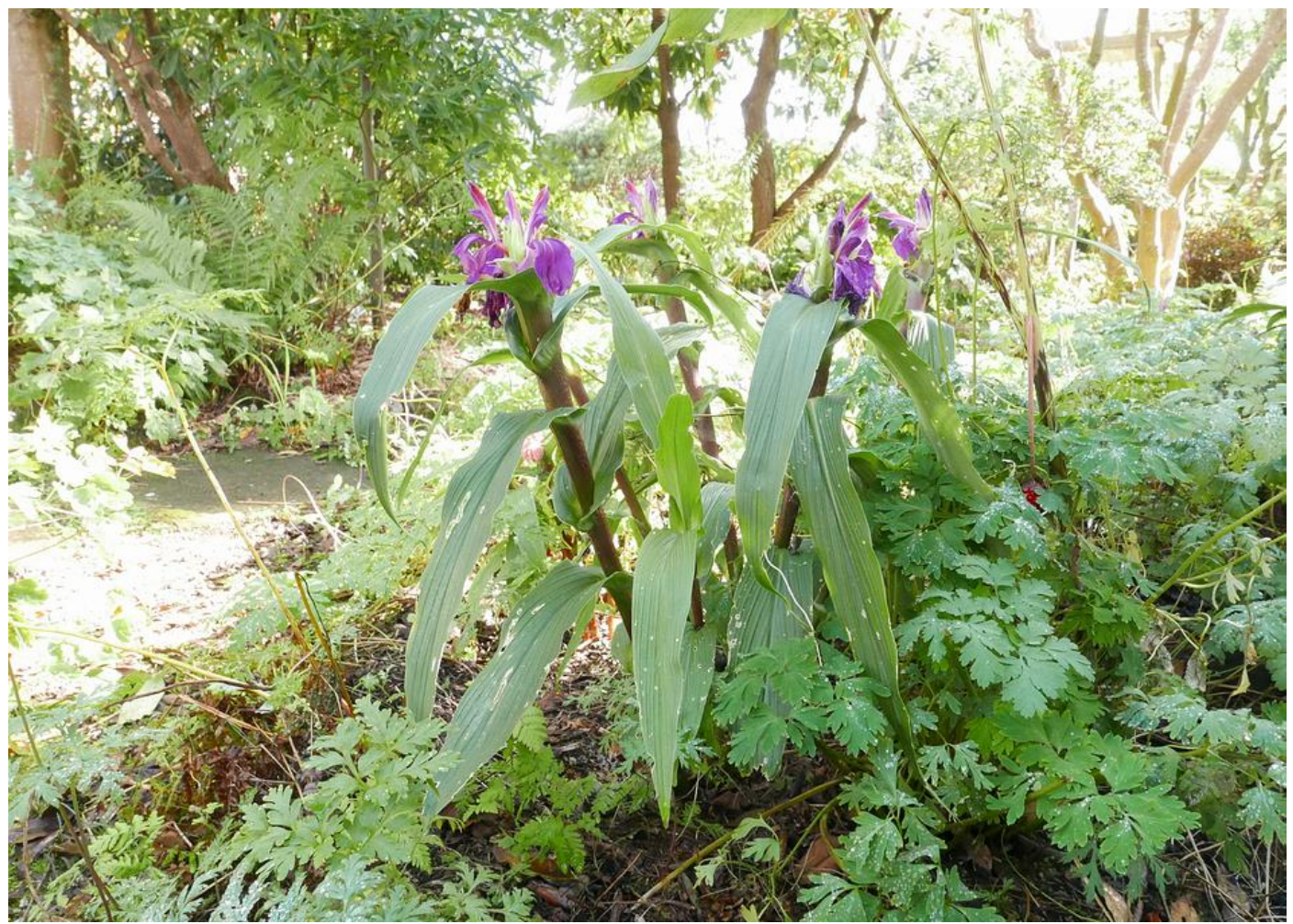
Roscoea 'Harvington Imperial'