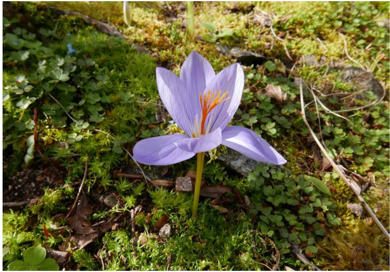
One of the many Crocus hybrids that we have raised by collecting and sowing our own garden seed.